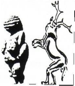
The earliest images of our Goddess, the Great Mother, are 60,000 years old. The earliest images of our God, the Horned Hunter, are 35,000 years old. We may understand them differently than our ancestors did, but these images are still meaningful and sacred today.

We worship differently than our ancestors did – and we will never know exactly how our ancestors worshiped – but the idea that the Gods are part of the universe and not separate from it has come down to us intact. Ritual still attunes witches to natural cycles. The eight Sabbats we’ve come to recognize re-enact the God’s life cycle on the Wheel of the Year. Moon Circles, called Esbats (pronounced “ess-bats”) honor the Goddess’ triple aspect.